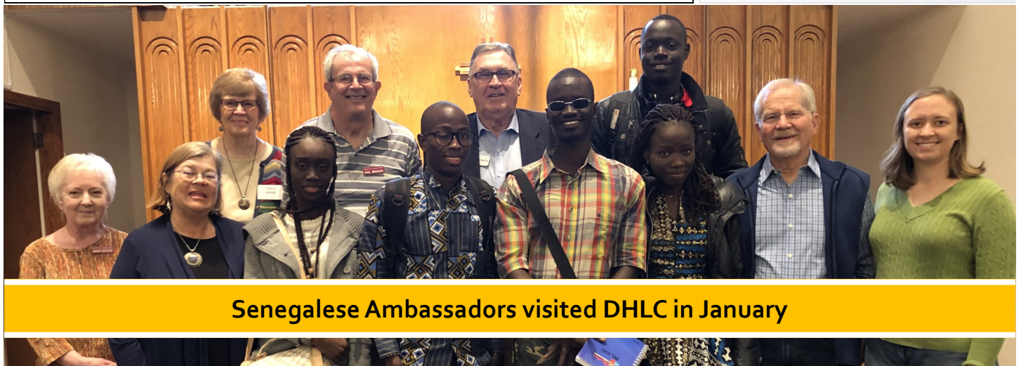
Senegalese Ambassadors visited DHLC in January