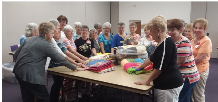
Our group asking a blessing on the quilts.

We are adding one new step to our quilt making. While putting them together, our mission sometimes gets lost in the process. We have decided that at the end of each day, we will gather to ask God's blessing on the quilts and recipients.