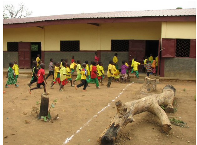
A new school building built with ELCA funds